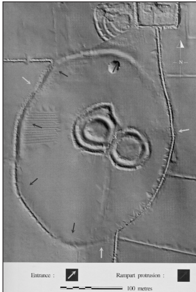
Figure 2: Hill-shaded model of Raith na Rig. The white arrows point to possible entrances. The black arrows indicate areas where the elliptical curve of the earthwork bulges, possibly to accommodate earlier monuments. Newman 1997, Fig. 22.

during the final phases of prehistoric activity at Tara. Unfortunately, the construction of a church in the twelfth century, and activity by British Israelites in search of the Ark of the Covenant at the beginning of the twentieth century, inflicted severe damage to the monument. 36