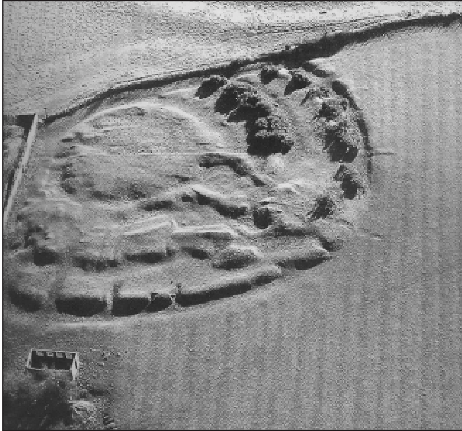
Figure 3: Ráith na Senad. Newman 1997, 91.

Romano-Britain on the fringes of the empire... 38 The fourth phase of Ráith na Senad appears to be the only residential enclosure at Tara, but further excavation of numerous other circular enclosures at Tara may change this assumption.