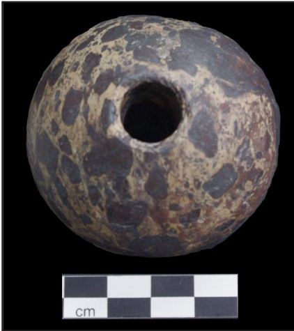
Figure 4: Macehead from Trench 5, Çatalhöyük West