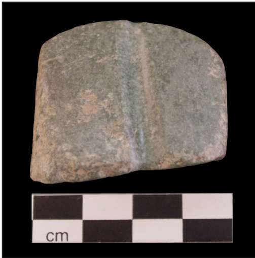
Figure 3: Serpentinite Grooved Axe Bit