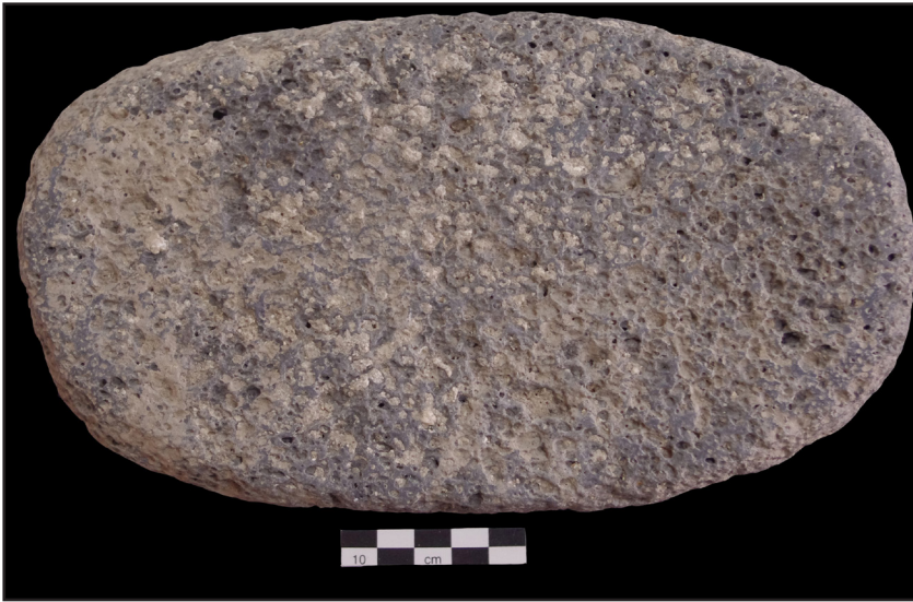
Figure 2: Andesite Grinding Handstone

(0.85%, n=3 ), and diabase (1.14%, n=4 ) make up the rest of the igneous rocks.